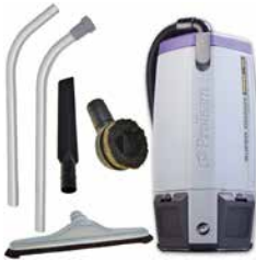
PT107303 Pro 10 Backpack Vacuum

To begin the process, gather all the necessary supplies, which may include: