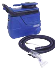
MX501000 Spot Extractor

For additional options contact your Maintex Sales Consultant or visit us online at maintex.com