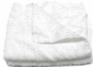
2622502 White Cotton Bar Towels