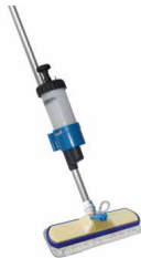
FT-BB-020-00 Bonnit Bug/Pole Spotter