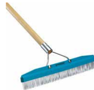
263499 Carpet Rake