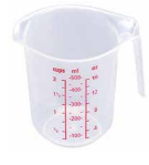
2701281 Measuring Cup