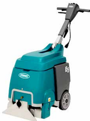
TE9004194 Tennant E5 Low-Profile Extractor

Order your janitorial supplies directly from Maintex • Visit us online at maintex.com