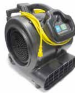
TE9014819 Air Mover