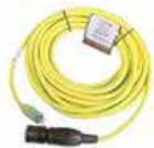
262619 Extension Cord