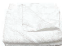
2622502 Cotton Bar Towels - White