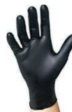
212842 Black Gloves