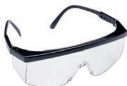
2637334 Safety Glasses