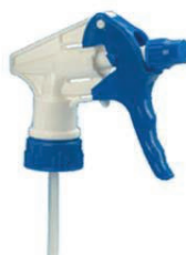
262235 9" Sprayer