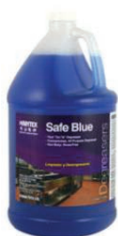
114304 Safe Blue Cleaner