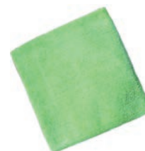
225561 Microfiber Cloth Green