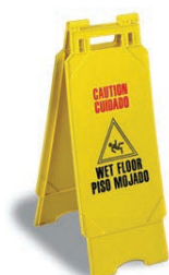
26892330 Wet Floor sign