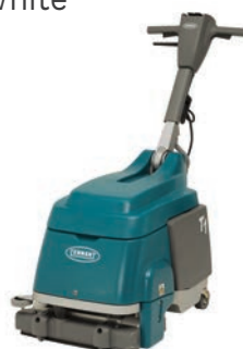
TE9008638 Tennant T1B Mini Floor Scrubber

Order your supplies directly from Maintex or visit us online at www.maintex.com