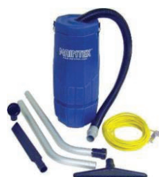
MX202001 Back pack Vacuum Professional Choice