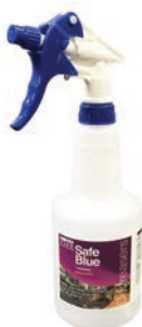
290044S Safe Blue Spray bottle with sprayer (empty bottle)