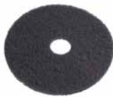
2255200 Black Strip Pad