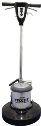
MX17-01 Swing Floor Machine

If using a swing floor machine you will also need: