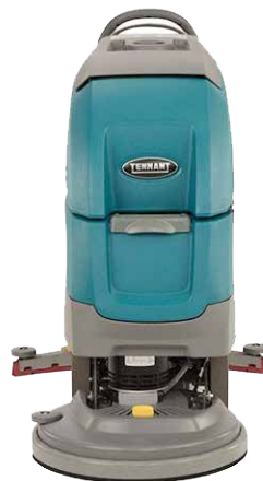
TE-T300 T300 Walk Behind Scrubber

If using a automatic scrubber you will also need: