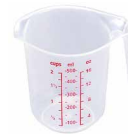
2701281 Measuring Cup