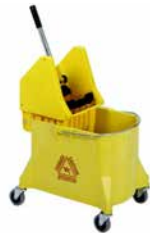
23570932 Bucket/Wringer Combo