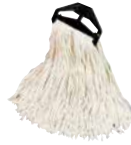
210635 Cotton Wet Mop