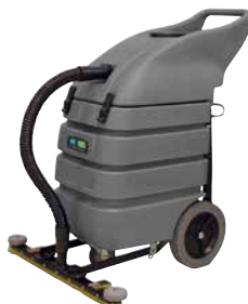
V-WD-15S Wet/Dry Vacuum

If using a automatic scrubber you will also need: