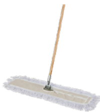
261536 36" Dust Mop Complete

To begin the process, gather all the necessary supplies, which may include: